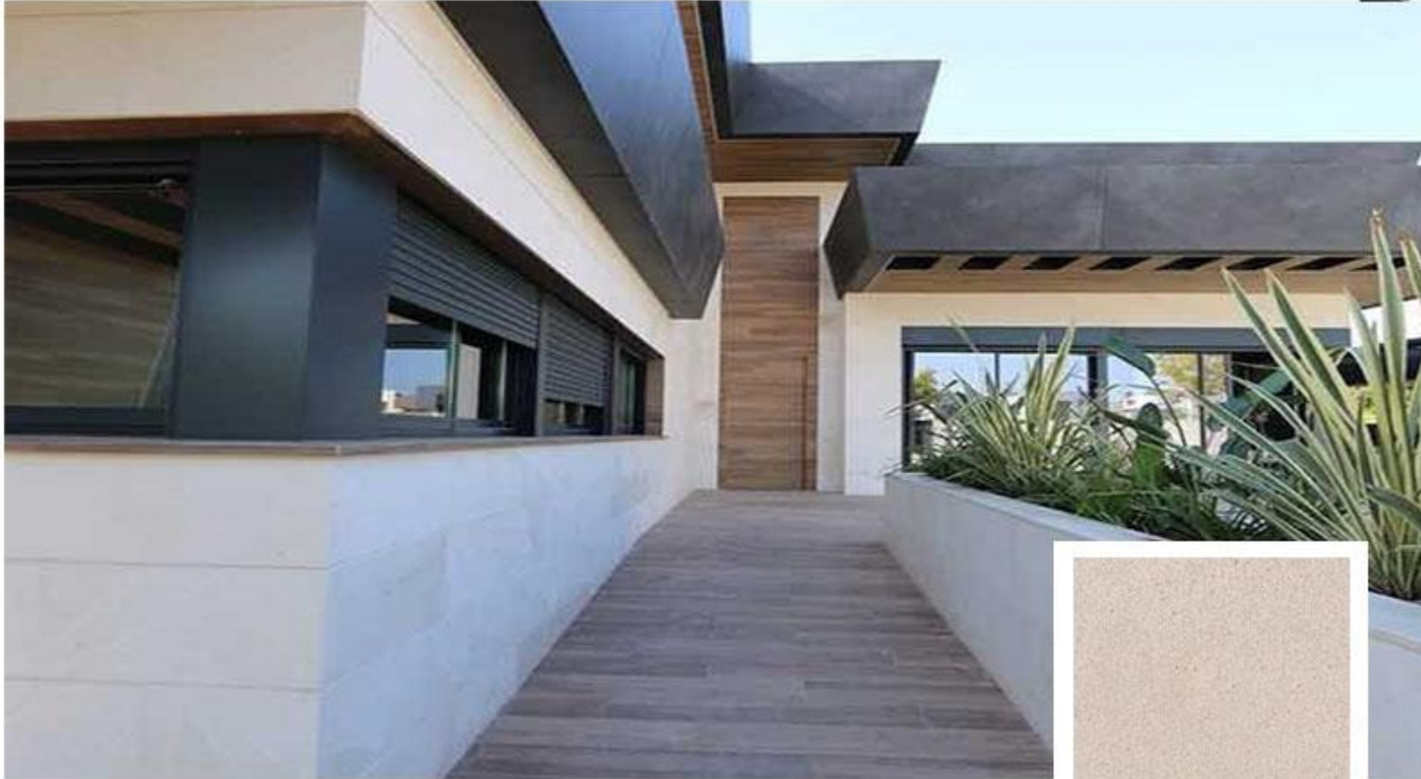
panj tan stone factory : 1 km of road - fasa bridge - shiraz - iran