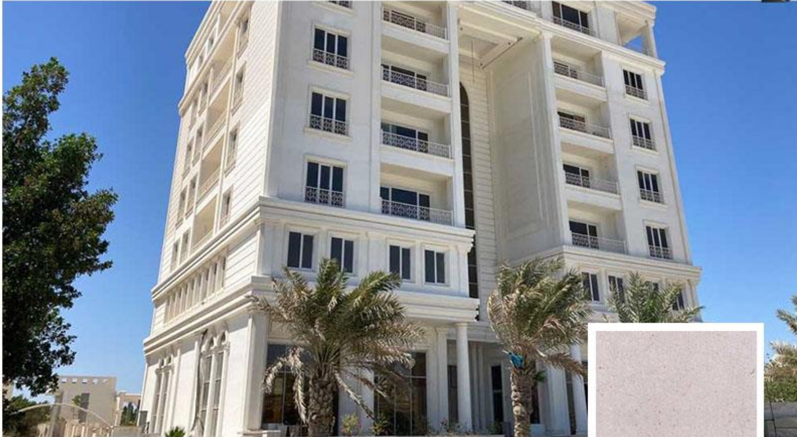
panjan stone factory : 1 km of road - fasa bridge - shiraz - iran