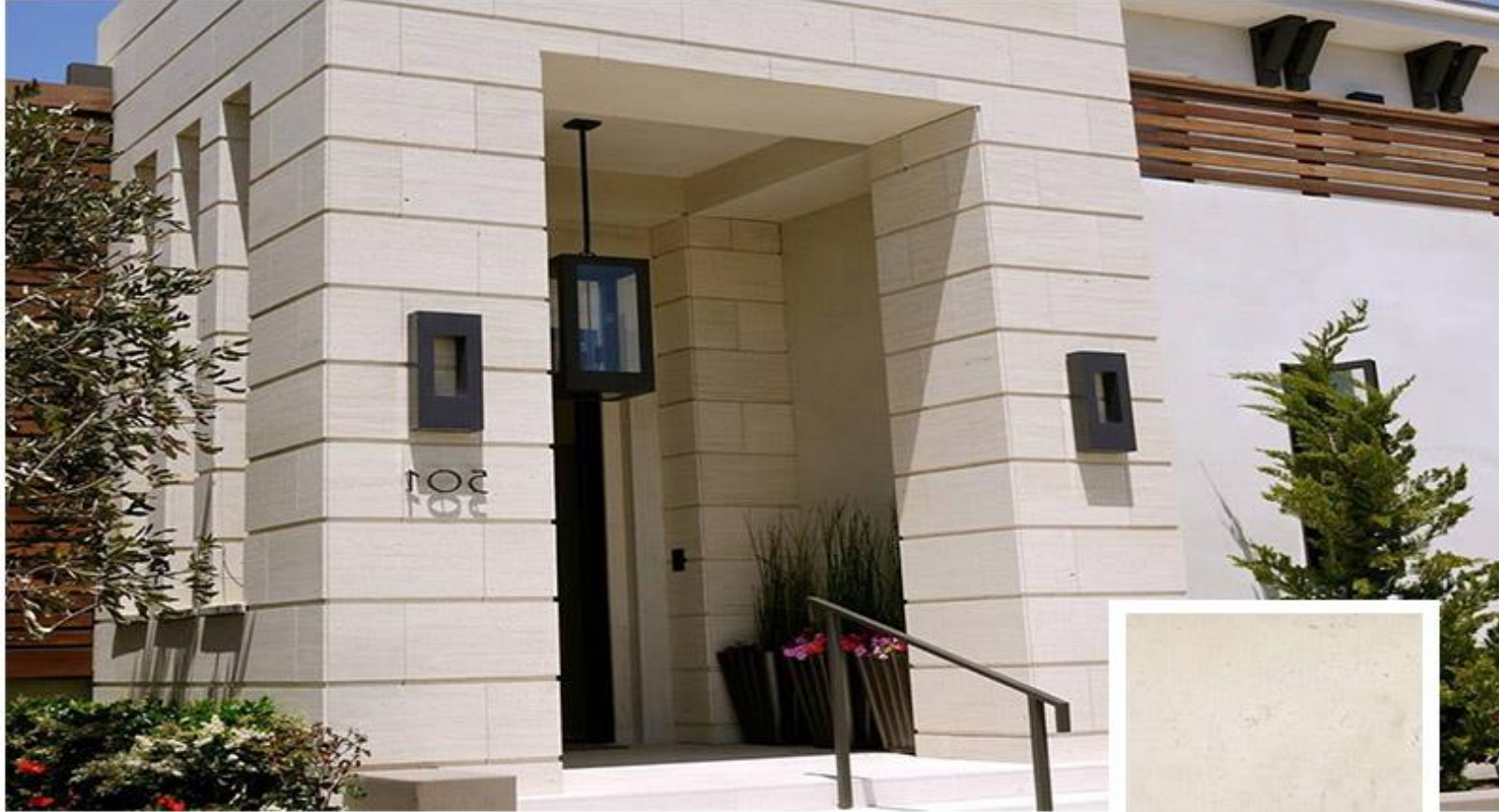
panj tan stone factory : 1 km of road - fasa bridge - shiraz - iran