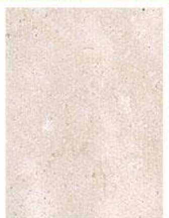
no: bkl 1