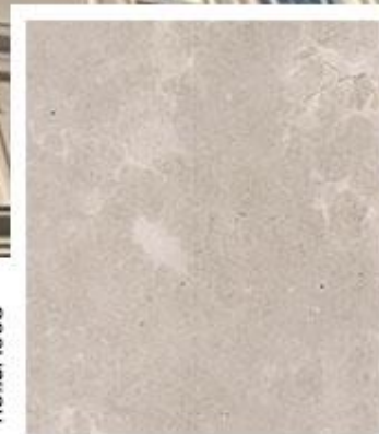
panj tan stone factory : 1 km of road - fasa bridge - shiraz - iran