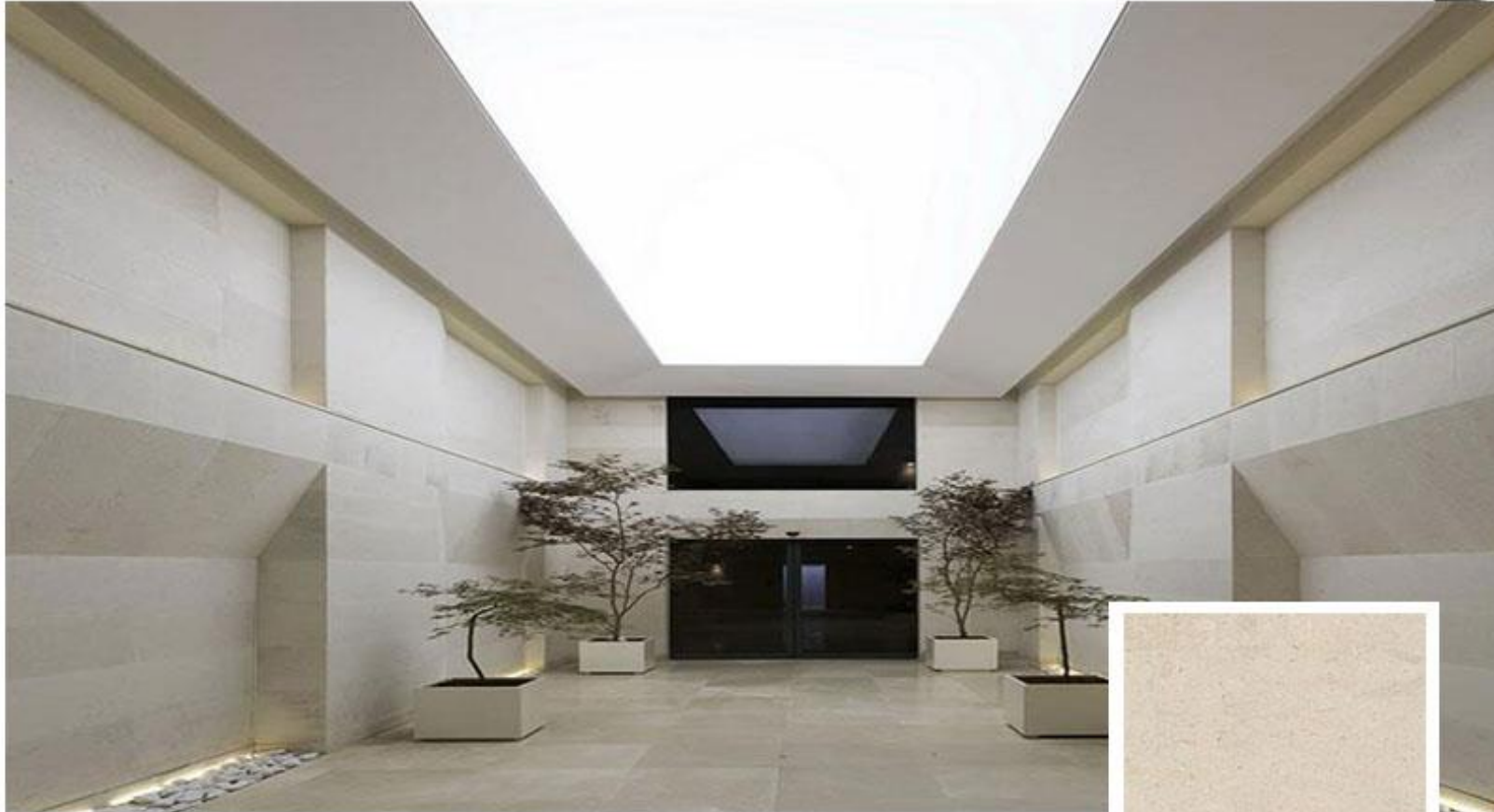
panjan stone factory : 1 km of road - fasa bridge - shiraz - iran